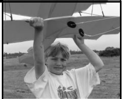
Local kids fly high at the 4th annual Kite Festival in June. Habitat Families provide food and fun for hundreds at Todd's Point.