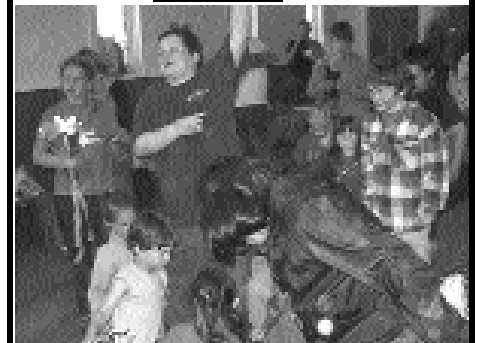
Habitat Families provide another exciting nite of food and festivity for kids and parents at the popular Cinco de Mayo Mexican Dinner in Fort Bragg.