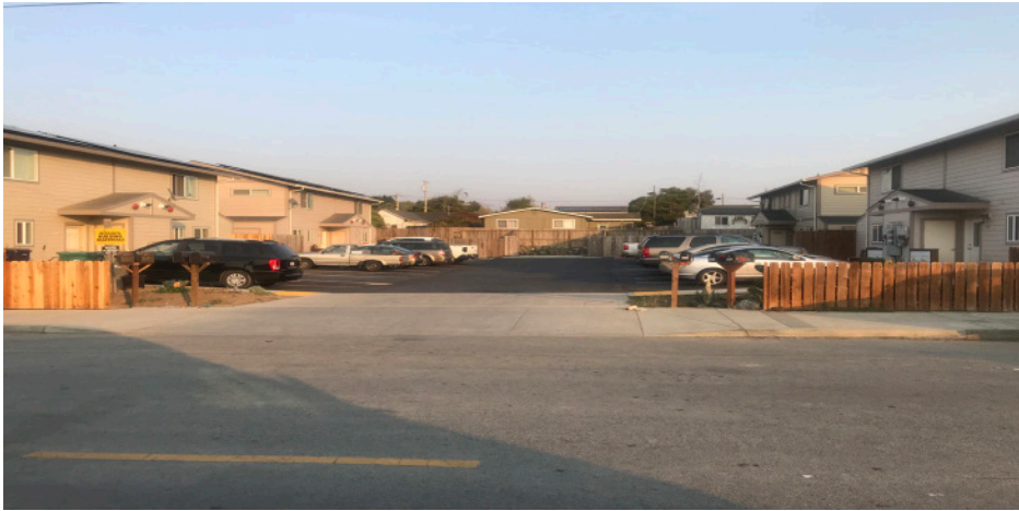
Chuck Greenberg Court 2018. From bare land in 2010 to this.

At long last we have housed all eight families on McPherson St. The parking lot is paved and all that remains are a few plantings and the low voltage lighting marking the sidewalks.