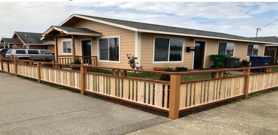
The Chilton home gets a major facelift.: Sold in 1996, remodeled in 2018