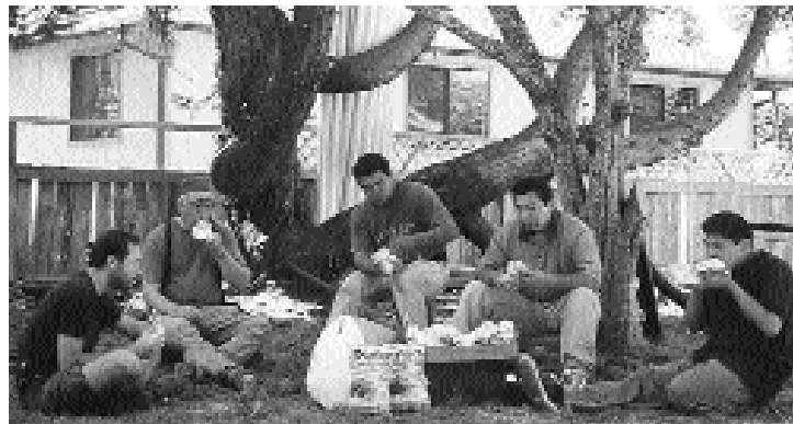
Cano Ku Remodel Crew