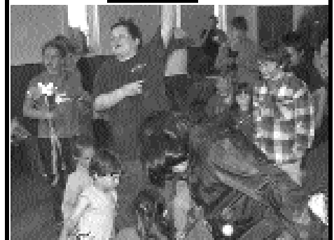
Habitat Families provide another exciting nite of food and festivity for kids and parents at the popular Cinco de Mayo Mexican Dinner in Fort Bragg.